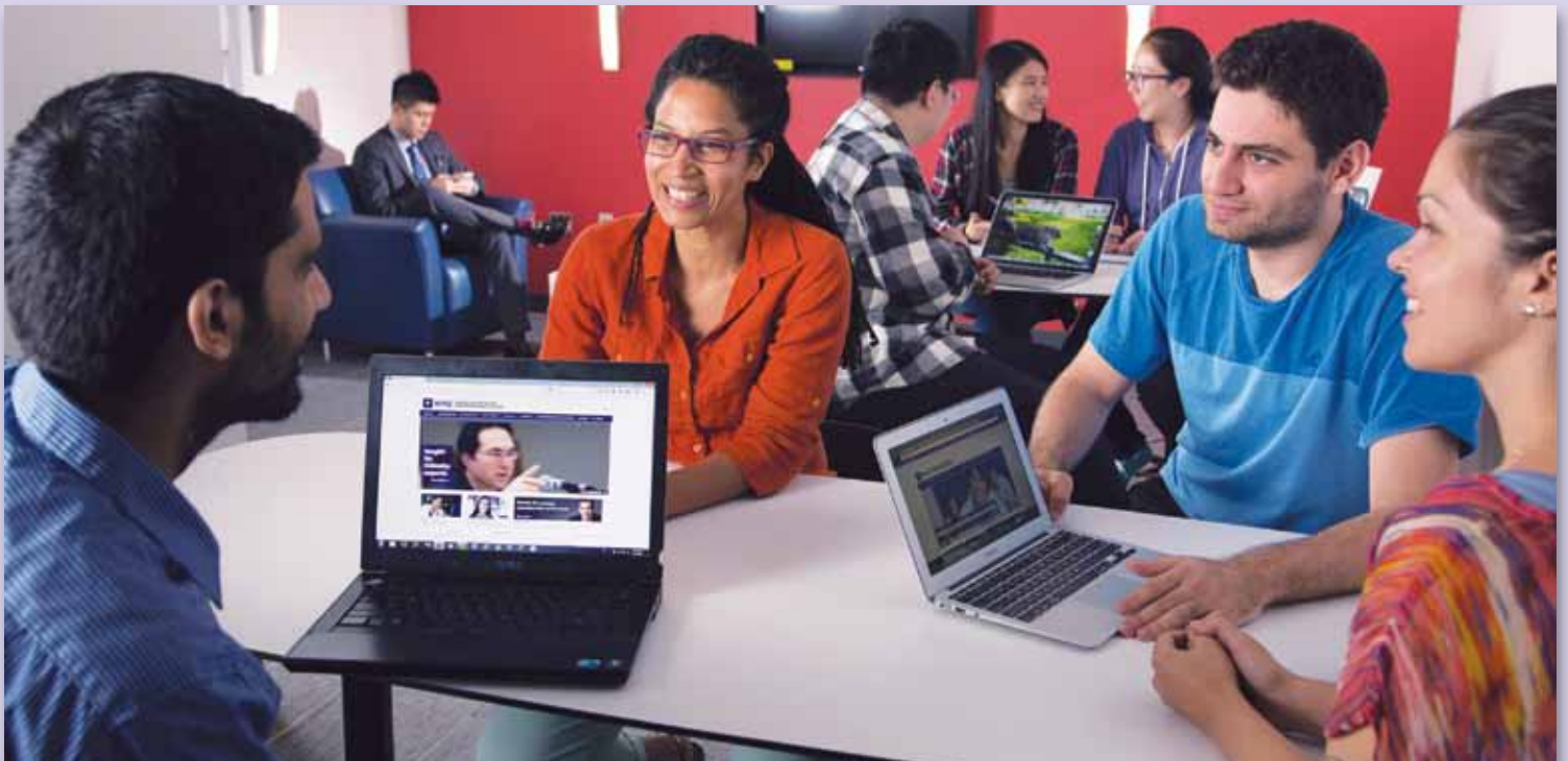
Students can take advantage of a number of resources at the NYU School of Professional Studies and the University at large.

This is just the beginning of your relationship with the NYU School of Professional Studies, which we hope will be rewarding, transformational, and lifelong.