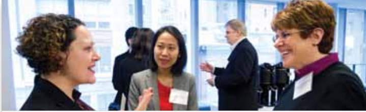
Students met with employers from the U.N.; Nielsen; Expedia, Inc.; Silverstein Properties, Inc.; and more to expand their professional network at the Wasserman Center Experienced Professionals Breakfast on March 6.